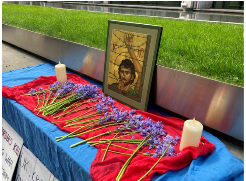
A focus for prayer at the vigil outside the Home Office

It is very poignant to stand and pray for those in power and for those who suffer, at the foot of the imposing Home Office building in Marsham Street. This is the place where the policies are made, where the 'hostile environment' was thought out and made a reality, where individual cases are deliberated and people are rejected or accepted into the UK. We invite those who pass by, sometimes workers at the Home Office, to join us for a few moments and to find out about why we do this. Some show interest and support; many others do not have the time and look away.