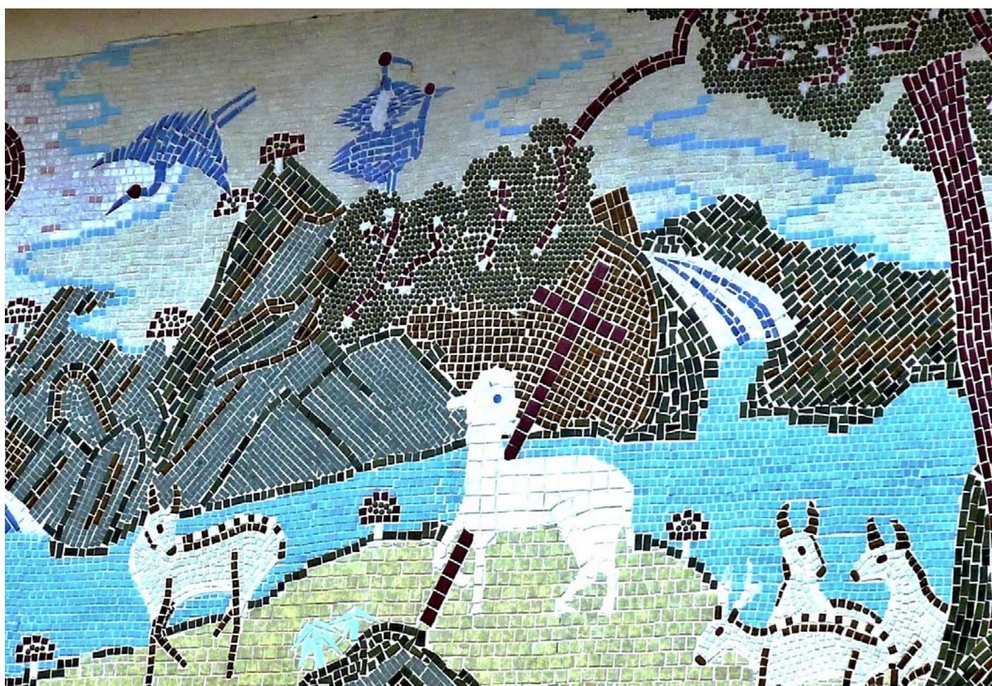
Ten Nature Symbols of Long Life (Sip Chang Seng) with the Lamb of God. The mosaic was created by the Youth Group of the Korean Sar Jik Parish.