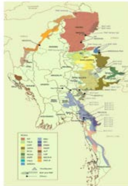
Figure 1B | The geography of active armed conflict in Myanmar.

in vulnerable groups like young children and youth. There has been an increased in drug addiction and alcoholism among young people. Displaced children and youth have little access to health and education services. Many are orphaned or abandoned.