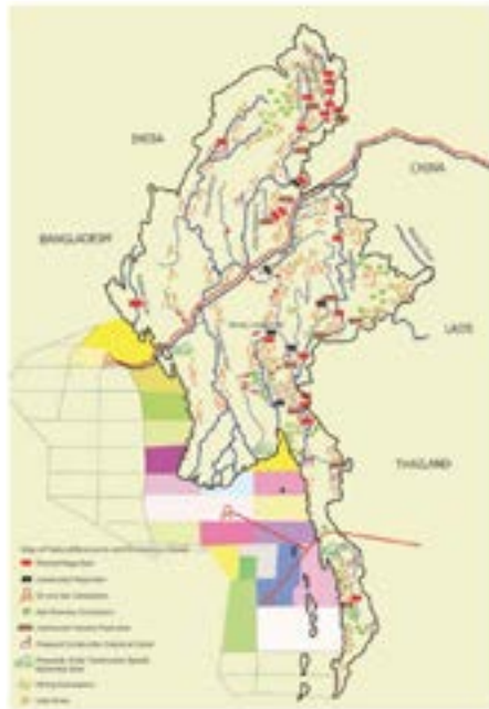
Figure 1A | The geography of natural resource wealth.

But the election this month was a victory for the National League for Democracy party which has secured 399 placing the party at a stronger position. Then a move first of its kind, NLD reached out to 48 ethnic political parties including those from Kachin state - calling on them to join the NLD in building a democratic federal union. The NLD spokesperson commented that "Together they could work effectively for ethnic affairs and ending civil war." This is a great development for the peace process.